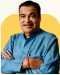
Sh. Nitin Gadkari

Hon'ble Union Minister of Transport Govt. of India