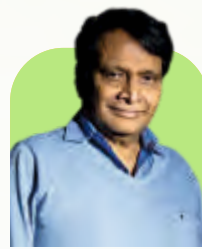
Sh. Suresh Prabhakar Prabhu

Hon'ble Union Minister of State for Agriculture and Farmers Welfare Govt. of India