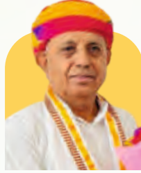
Sh. Bhagirath Choudhary

Hon'ble Union Minister of Transport Govt. of India